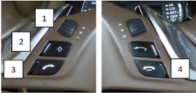
Steering wheel type 1: