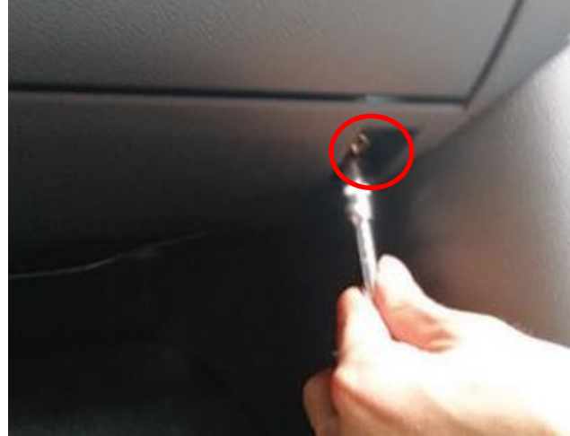
2. Remove the two screws below the glove box and take out the head unit.