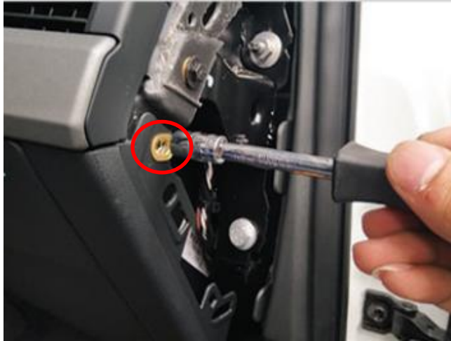
1. Remove the screws, open the glove box and remove the six screws