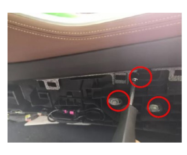
3. Remove the screws on the left and right bezels.