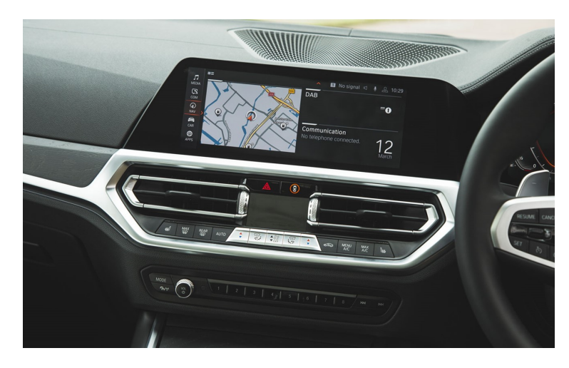
1. MGU platform system

Please ensure the car is switched off to avoid damaging the interface/vehicle