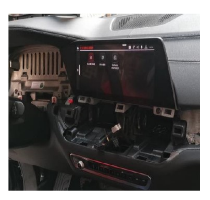
10. Remove the central display