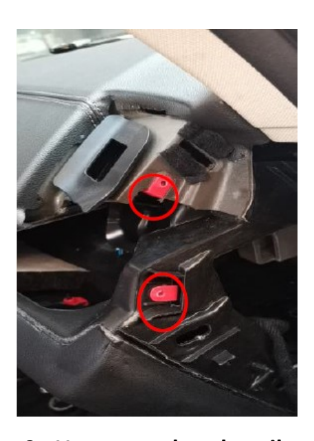
9. Use a panel tool to tilt down the fixed bezels on the display and remove the screws on both sides