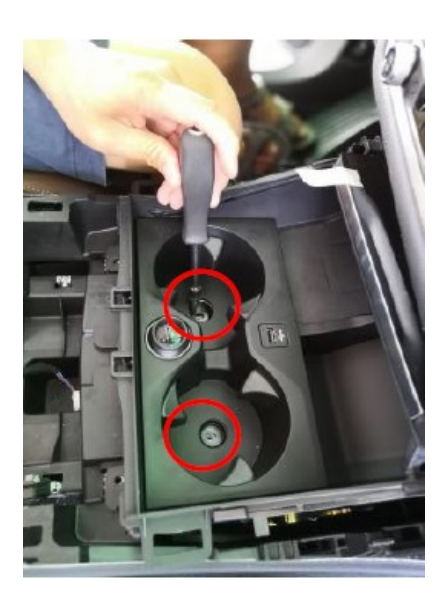
6. Remove the two screws as shown