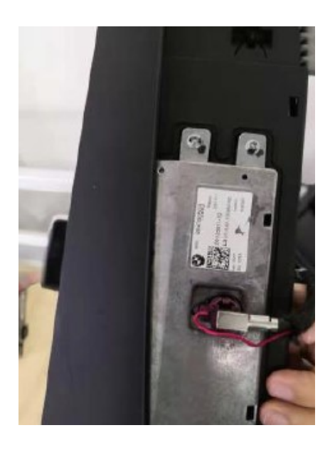
11. Make the LVDS connections (As Shown in the installation diagram