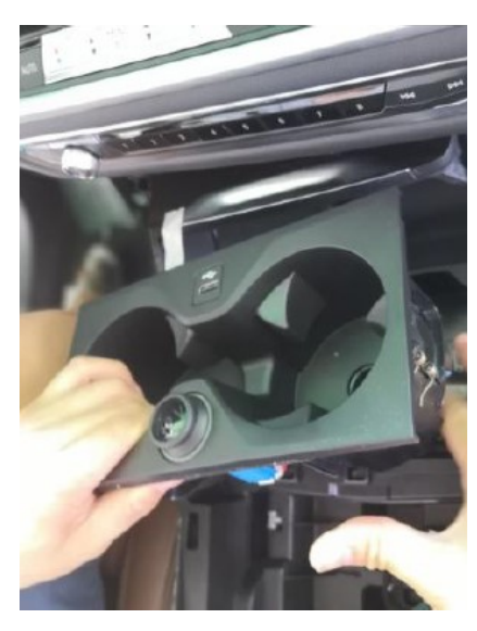
7. Remove the dual plastic box