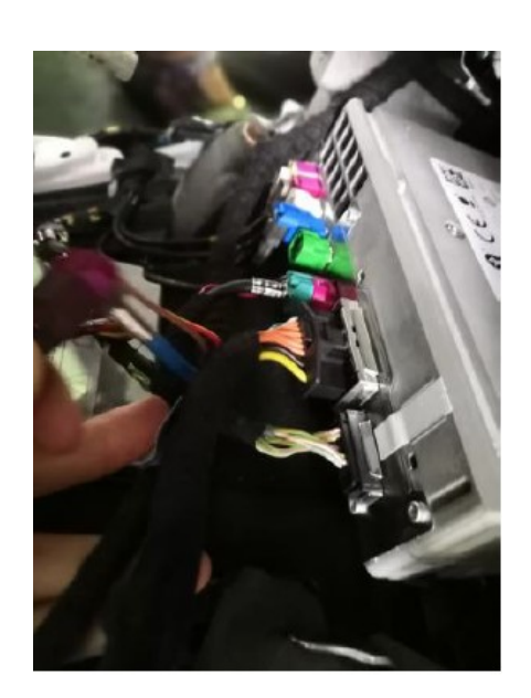
8. Make the power connections (As shown in the installation diagram)