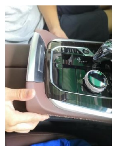
5. Remove the centre control panel