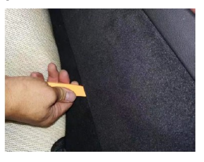
2. Use a panel tool to lift the left and right interior away.