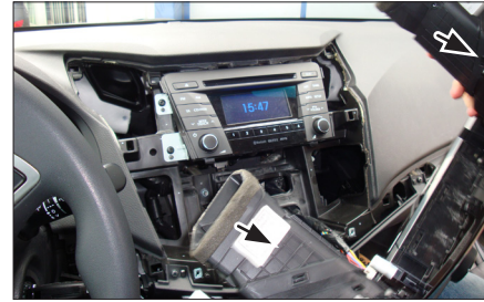
5. Remove air vent frame