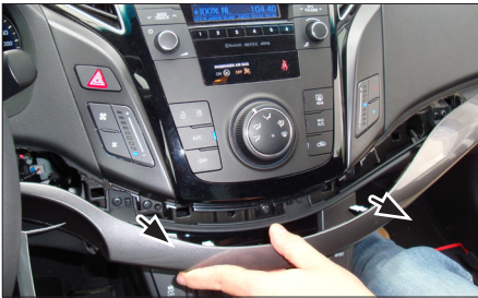
3. Unclip OEM bar under head unit (see arrows)