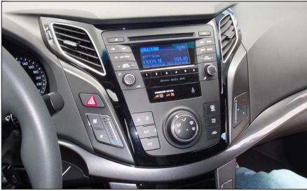
1. Hyundai i40 OEM dash board