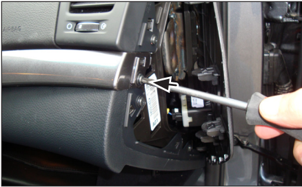
2. Remove bar under OEM head unit (see arrow)