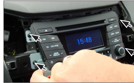
6. Remove screws of OEM head unit (see arrows)