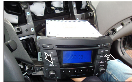
7. Remove OEM head unit