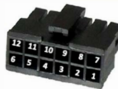
Pin numbers in the connector