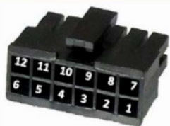
Pin numbers in the connector