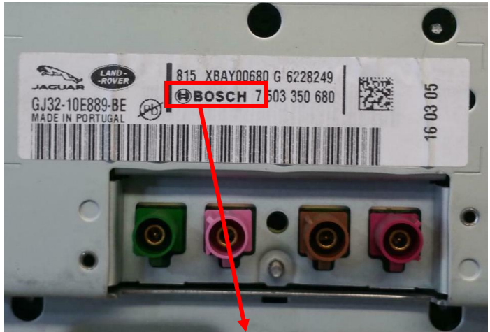
"Bosch 7" displayed on rear of the OEM monitor