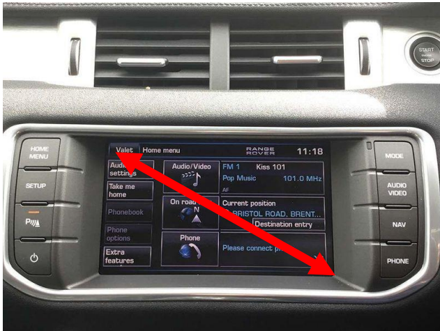
The screen should measure 7-8 inches diagonally

To be compatible the vehicle must have the MFD dual screen view system with a 7-8-inch Bosch display. There are 2 ways to check, either measure the screen diagonally across such as in picture below. Alternatively remove the OEM monitor carefully and check behind. The BOSCH logo and number 7 (highlighted below) should be displayed on the back of the monitor.