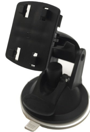
Window Glass Mount (Included)