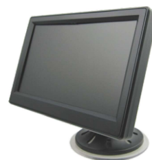
Matt Black Frame Design

Screen type: TFT LCD Screen size: 5" color Resolution: 480*RGB*272 Brightness: 400cd/m 2 Display format: 16:9 Video input: 2- channel Voltage: 12V